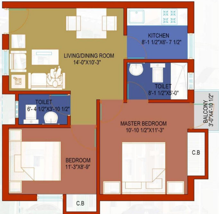
2BHK (Type B) - Super Area (sq. feet 900) 2BR + 2 Toilet